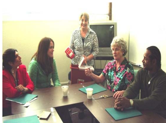
Drop to Stop Needle Disposal Day