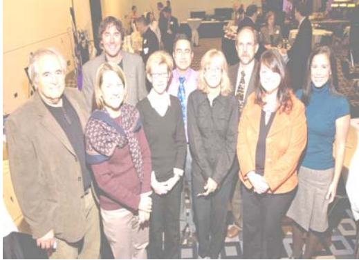
University of Colorado Denver's Liver Transplant and Hepatology Team Members

It's Official: Desserts & Delights is the signature fundraising event for Hep C Connection!